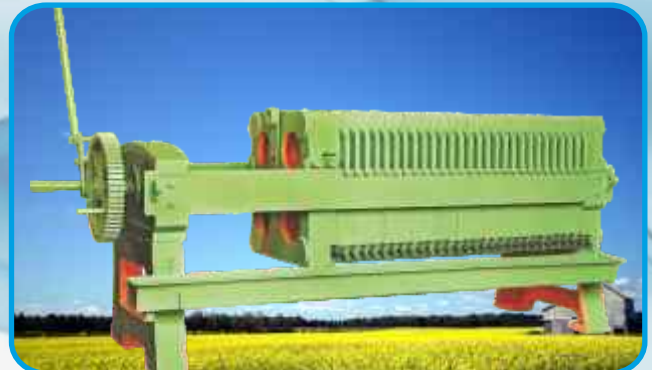
PLATE & FRAMES TYPE FILTER PRESS