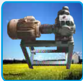
← Gear Pump (for Filter Press)