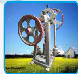
→ Filter Press Pump